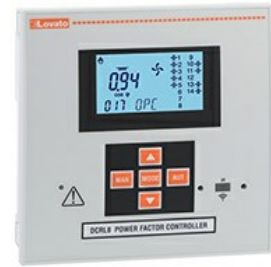
Automatic power factor controller, 8 steps, icon display DCRL8